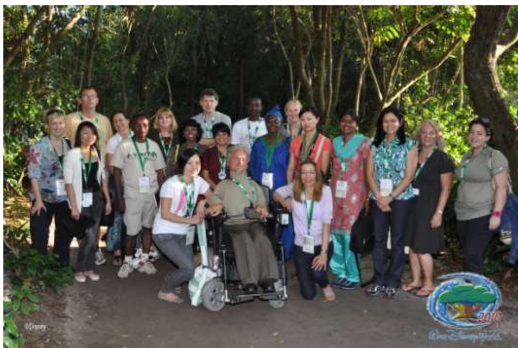
IZE Grant recipients and the IZE board at the 2010 conference